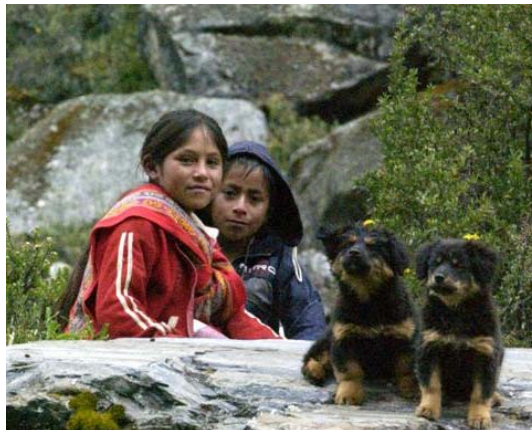
Shepherds and their dogs

around town stopping at different little stores to perform. The store owner must "pay" them with food, some sort of gift or money to receive a "blessing" and have a prosperous year. They also will dance in front of different shrines around town. Its roots are definitely firmly planted in paganism which can clearly be seen in the masks they wear.