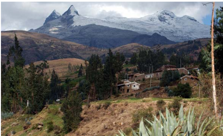
Lucma, with recent rains we see more snow in higher elevations