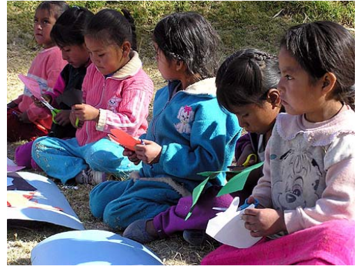
Hearing the Word taught.

16. We are hoping to hold a training ses-