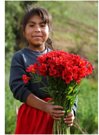
Quechua girl Harvesting & selling flowers

We do not pass through their struggles. We live in a third world country. Yet we cannot feel the struggles that most carry here day in and day out. Their worries are far different than ours. It is hard not to become cold and indifferent when at least five people per day come and ask for money.