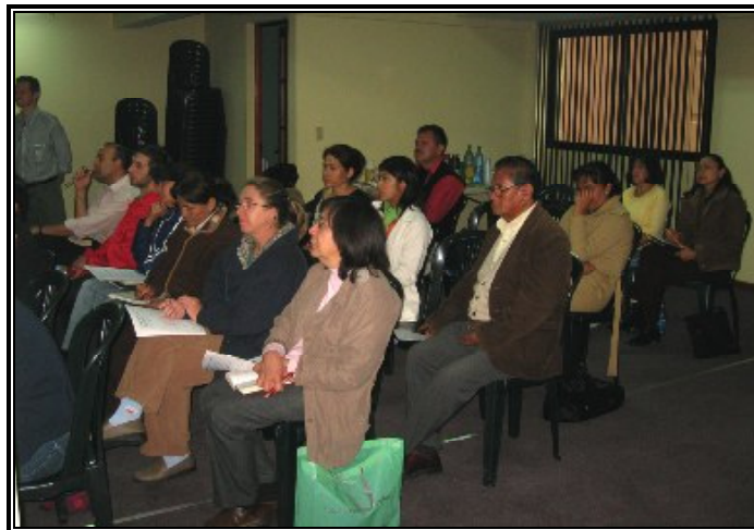
The Envoy Conference in February